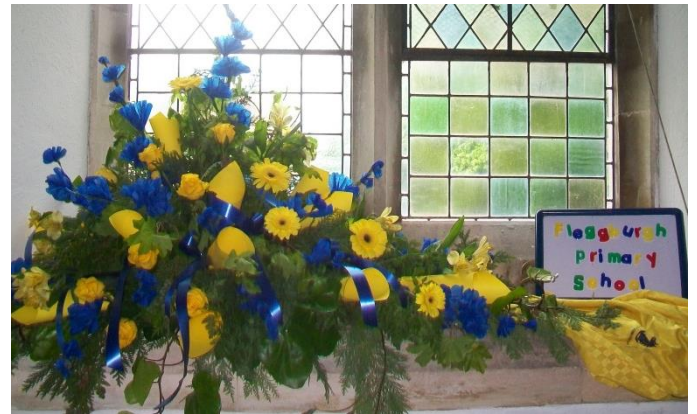
Church Flower Festival