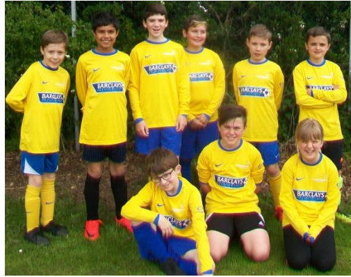
KS2 Cluster Football Tournament 20 th May 2019 Lingwood Primary School