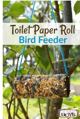
Toilet Paper Roll Bird Feeder

If you have some birdseed at home, you could spread some peanut butter onto a cardboard tube and then roll it in seed to hang up for the birds. If you are lucky enough to find a pinecone this can be used instead of the toilet roll.